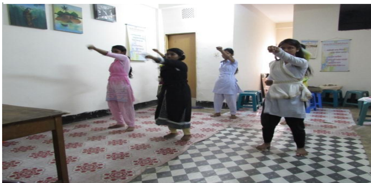
Girls Power Program at Slum areas