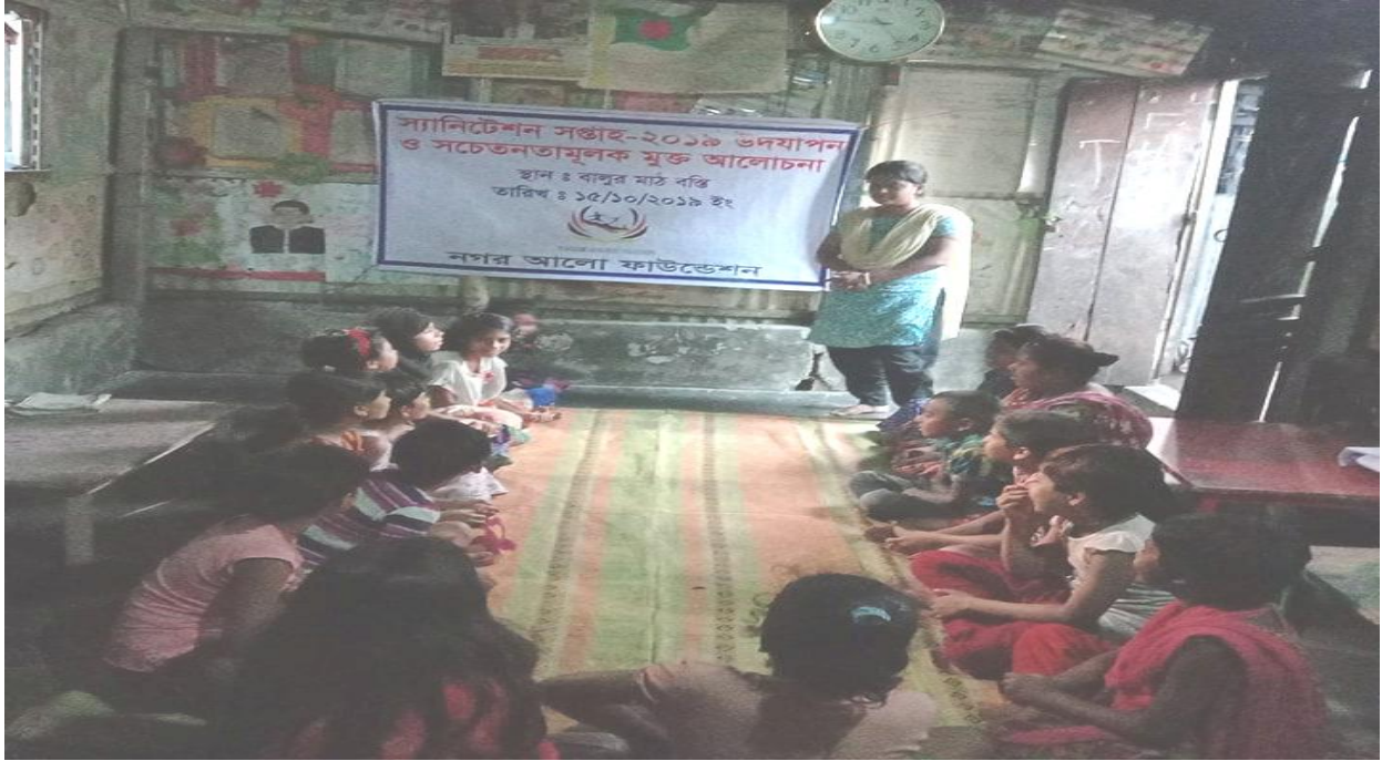
Observance Sanitation Week 2019 by Nagar Alo Foundation