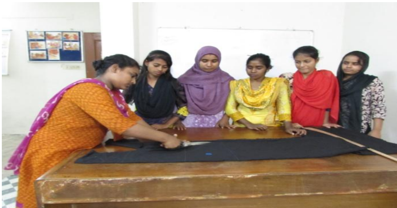
Training on sewing