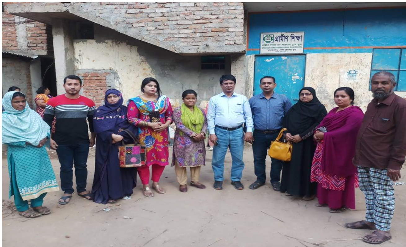
EC committee members of Nagar Alo Foundation