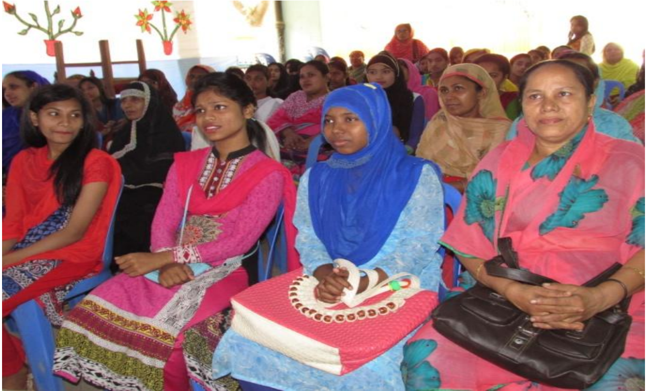
Women participation in NAF Program