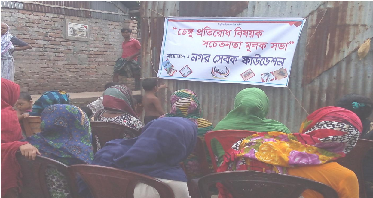
Awareness meeting at Mirpur slum of Dhaka on prevention of Dengue fever (As prior name before registration)