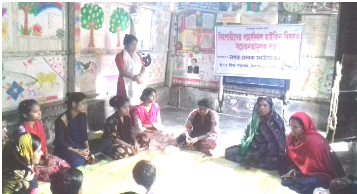
Awareness meeting at a slum of Mirpur area of Dhaka on water, sanitation and health hygiene for adolescent girls' issue (As prior name before registration)